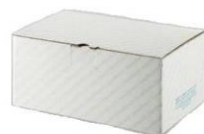
PCR ■ Designed for room temperature shipping